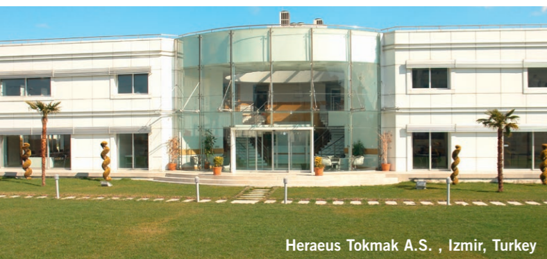
Heraeus Tokmak A.S. , Izmir, Turkey

in 2019/2020. This transfer consolidated part of the existing product line and now the portfolio is growing again. While the range of precious metal preparations for decorating ceramics, glass and tiles remains stable, the demand for highly specialized metallo organic materials used in technical applications is currently increasing thus driving product variety. We supply a multitude of materials to customers all around the globe.